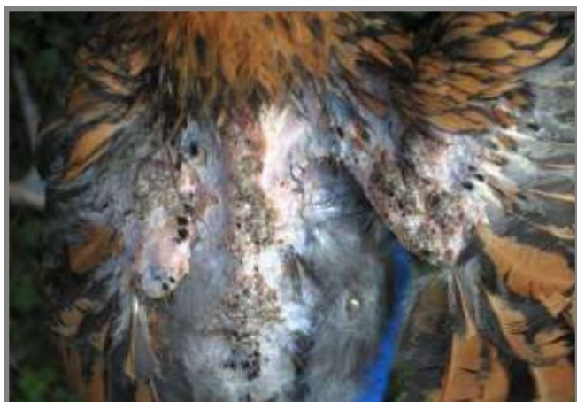
Pox lesions on body

Fowl pox runs for three to five weeks in affected birds. It can be transmitted through skin wounds such as insect bites, dubbing, fighting, or other injuries. It can also spread by means of feathers and scabs from infected birds. The disease can spread slowly from bird to bird, but usually spreads quickly when lots of mosquitoes are present. The lesions will start as small hard nodules that look like a pale blister. They can be less obvious at this stage. Over a few days they increase in size and scab over. The scabs fall off after a couple of weeks, sometimes leaving a small scar. Larger lesions can take longer. Pox lesions around the