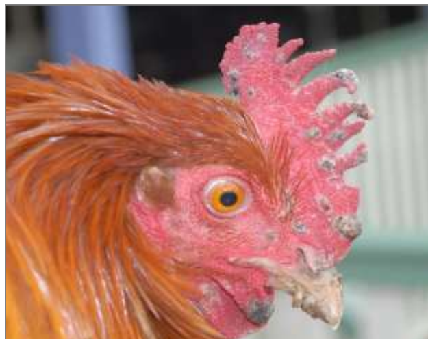
Pox lesions on Marans cockerel

The earliest indication of a pox infection is the birds going a little quiet and acting depressed. Sometimes you may notice respiratory symptoms, and perhaps loss of appetite. A few days later you may notice the first sign of pox lesions. The sores begin looking like a blister or a pimple which fill with fluid and then pus. Then they burst and a crust or scab forms over it. The scabs are usually dark and obvious and often this is the time when owners become aware of the disease and a diagnosis is made. In some severe cases, birds can develop lesions over their back, breast or other skin areas. The disease outbreaks that are limited to these symptoms are generally described as 'dry pox' (cutaneous form). Although there may be some losses, this is a disease