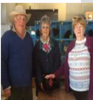
Ken Ludke Perpetual Trophy Overall Australorp