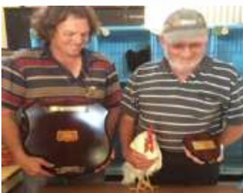
Ted Thompson Perpetual Trophy